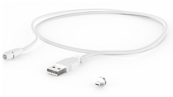
MT03-0301-069023 AUTOMATE | USB Kit 1 x cable and 1 x USB connector

Easy to snap the charger in place and pull it off when fully charged.