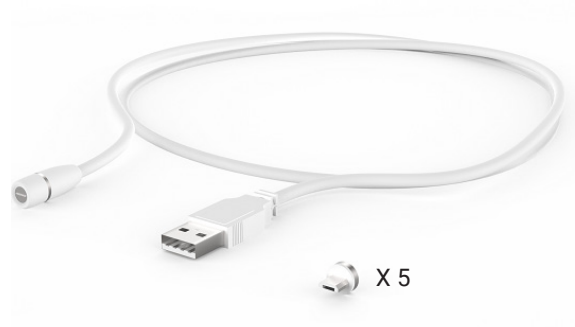
MT03-0301-069024 AUTOMATE | USB Kit 1 x cable and 5 x USB connectors